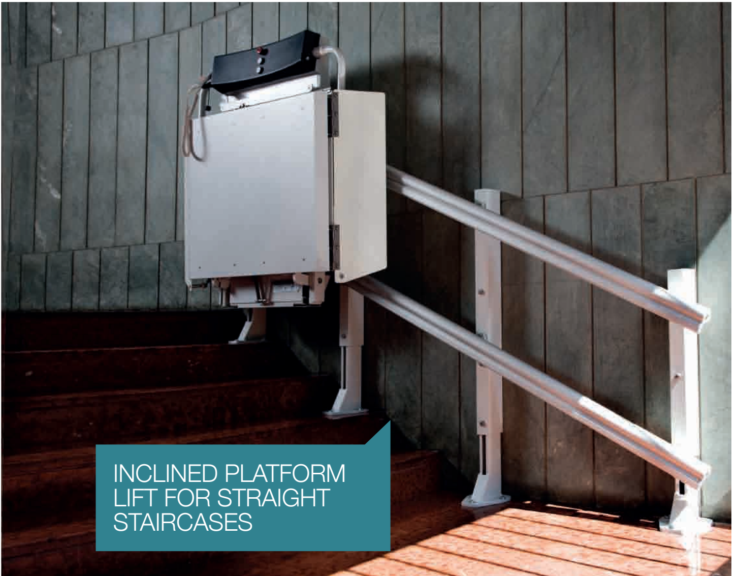
INCLINED PLATFORM LIFT FOR STRAIGHT STAIRCASES